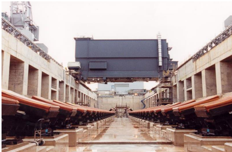
Figure 3: Reactor Access House (RAH) - HMNB Devonport, Plymouth/England [10].