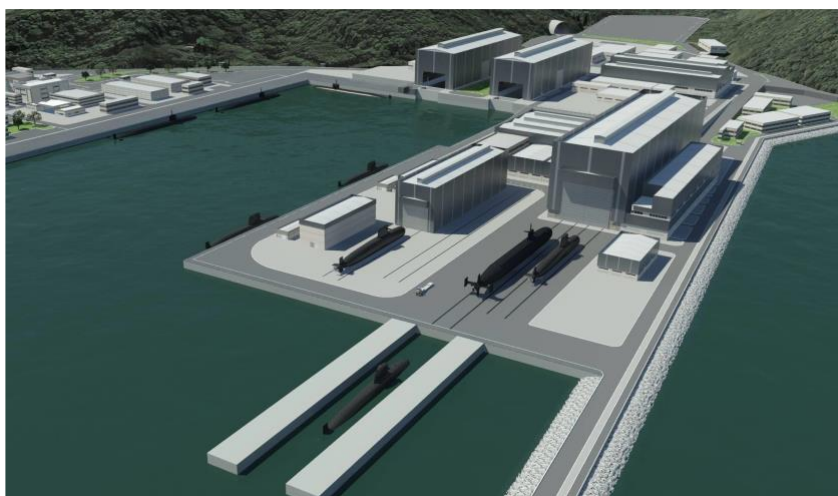
Figure 2: Artistic Conception of CME.