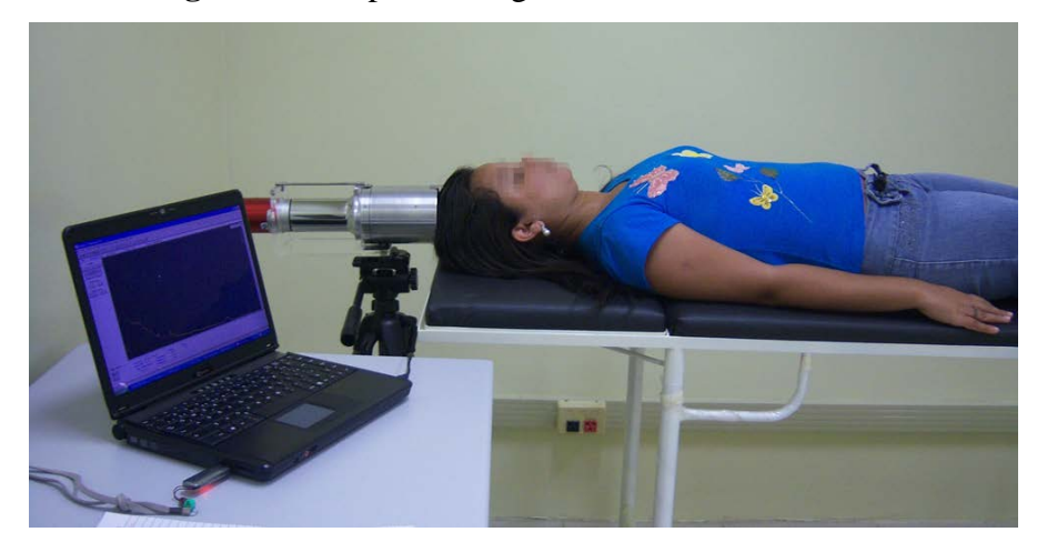
Figure 2: OEI positioning in relation to the detector