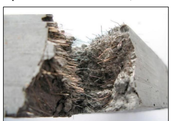
Figure 2: Example of fiber reinforced concrete (illustrative picture) [22]

Fibers can be naturals or synthetic. Synthetic fibers are mostly made of steel or polypropylene [17]. Fiber reinforced concrete is a material made of concrete (any type of CP, but most of CPII and CPV-ARI), admixtures and contains randomly oriented fibers, which improve the concrete properties under impact loads, dynamic properties and fatigue strength [21]. (Figure 2)