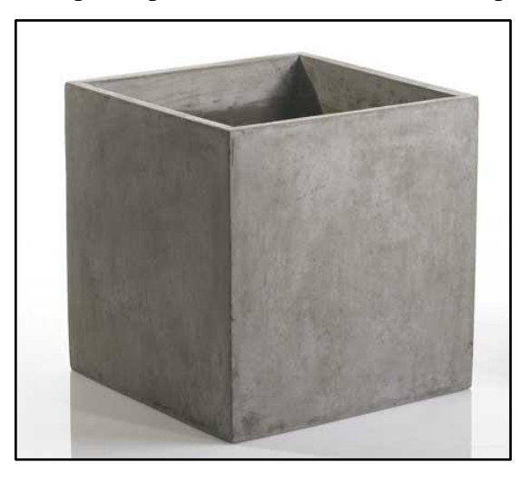
Figure 3: Example of precast container (illustrative picture) [24]

The form and size of the containers are expected to be cubic with one side opening, and with an internal capacity of 3-6 \text{ m}^3 . It will be made of precast concrete, using a steel mold. The cover plate will also be made the same way. This way, the parts can be manufactured in any location and only be transported to the Repository for storage and posterior use [24]. (Figure 3)