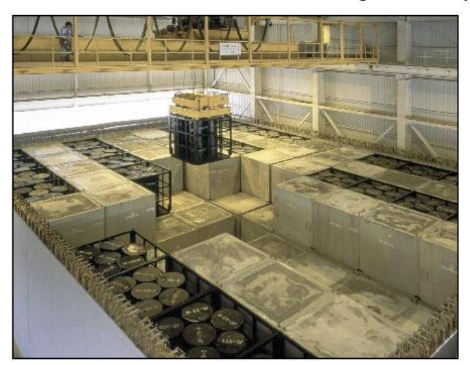
Figure 5: Concrete containers in El Cabril disposal facility [30]