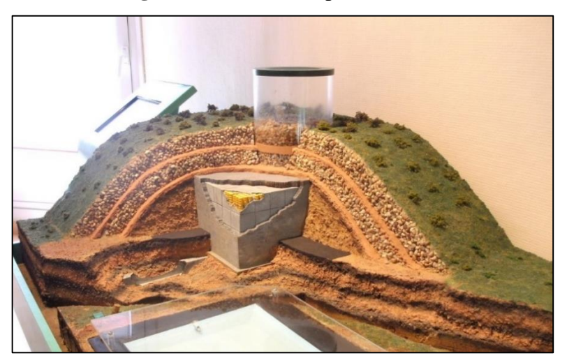
Figure 1: El Cabril disposal scheme