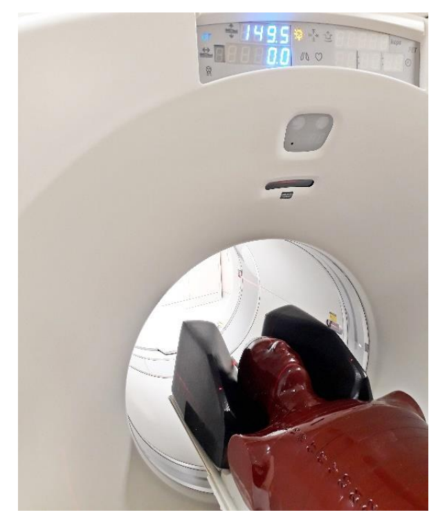
Figure 1: Positioning of the Alderson male phantom in the gantry