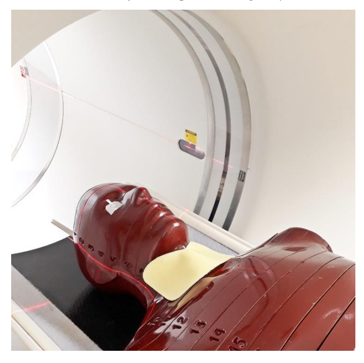
Figure 2: The phantom Alderson with the bismuth shield on the neck spot and a radiochromic film strip on the right eye