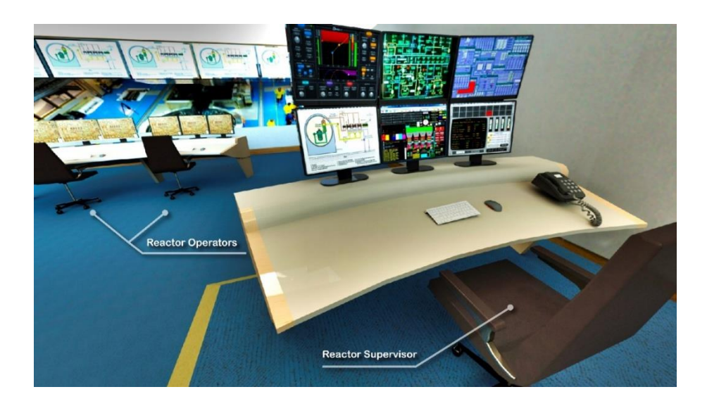
Figure 2: The main control room

The MCR is strategically positioned in the plant in relation to the Emergency Control Room [7]. The Emergency Control Room (which was not modeled in this project) has panels with the necessary information for the safe shutdown of the plant when the operators have to leave the MCR. In the Communication room, Figure 3, resources are available, as communication and emergency equipment for use in the management and communication between MCR and other sectors of the installation.