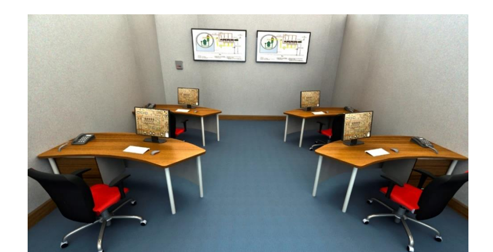
Figure 3: The communication room

The MCR is strategically positioned in the plant in relation to the Emergency Control Room [7]. The Emergency Control Room (which was not modeled in this project) has panels with the necessary information for the safe shutdown of the plant when the operators have to leave the MCR. In the Communication room, Figure 3, resources are available, as communication and emergency equipment for use in the management and communication between MCR and other sectors of the installation.