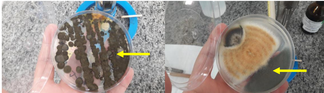
Figure 5: Cladospororium spp. in Petri dishes (yellow arrows).

Udaya et al. [15] isolated 17 genera from the surface of bus seats. Aspergillus spp. was most frequently represented inside the vehicle. Viegas et al. [16] reported that Cladosporium spp. was the most prevalent fungal species from taxi filters in three cities of Portugal (Lisbon, Loures and Setúbal). In this present study in São Paulo city, the Aspergillus genera was predominant, after NSF and Cladosporium spp.