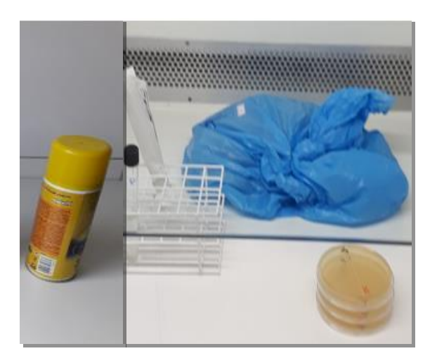
Figure 1: Filter samples kept in bags with sanitizer spray of denatonium benzoate.

After all treatment procedures, the samples were analyzed in Petri dishes, in triplicate (Figure 2), to fungal counting, expressed as colony-forming units (CFU) and percentage (%) [13].