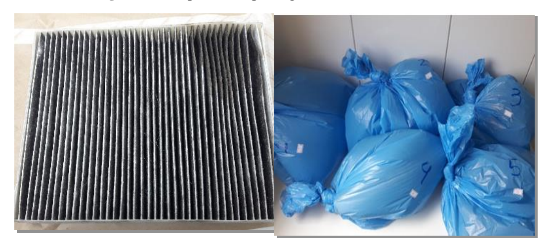
Figure 3: Sample filters packages to treatment I, II and III.