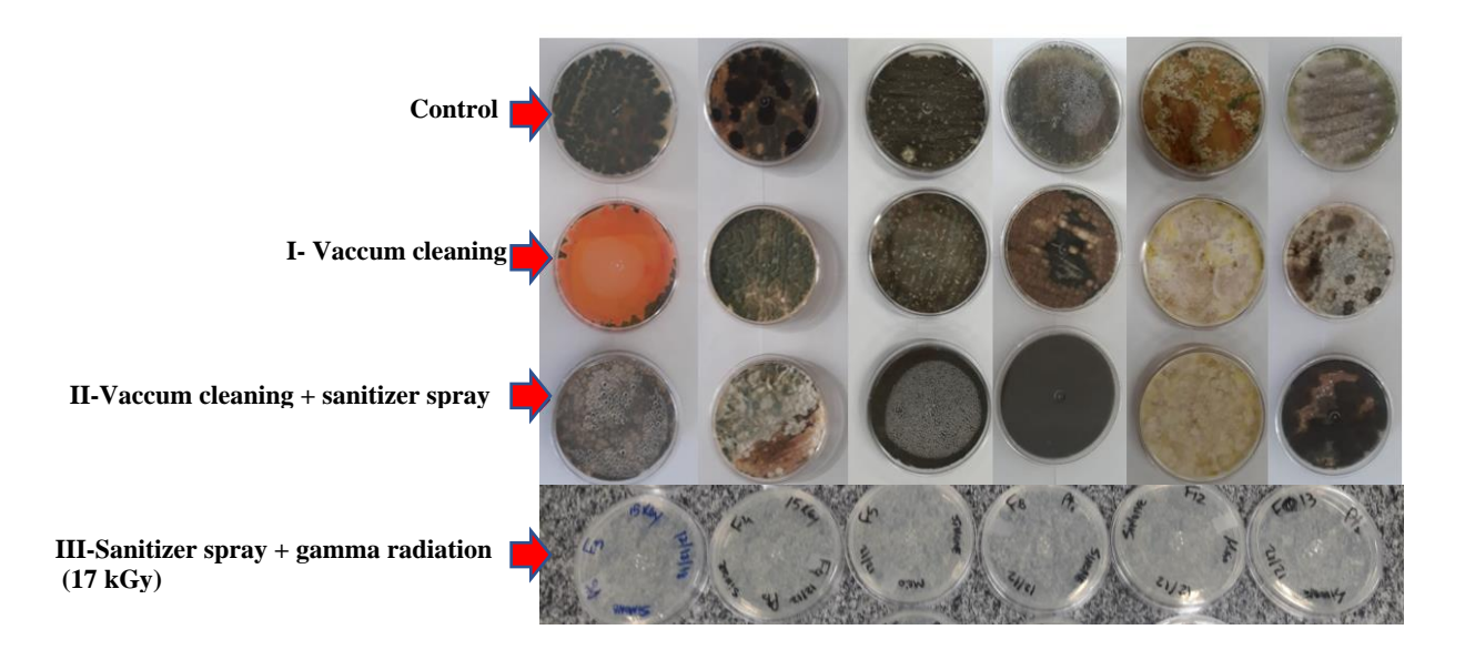
Figure 4: Petri dishes with fungi in control samples, vacuum cleaning (I), vacuum cleaning and sanitizer spray (II) and sanitizer spray with gamma radiation treatment (III).

The fungal growth was favored by high humidity conditions in samples that were sprayed with sanitizer, that did not inhibit the fungal contamination. According to Reponen and cols. [17], the relative humidity changes the spore size. The same authors reported that the highest change of the aerodynamic diameter was found in Cladosporium cladosporioides spores, that increased from 1.8 \mu m to 2.3 \mu m when the relative humidity increased from 30% to ~ 100%. The size increase corresponds to an approximate doubling of the particle volume [17].