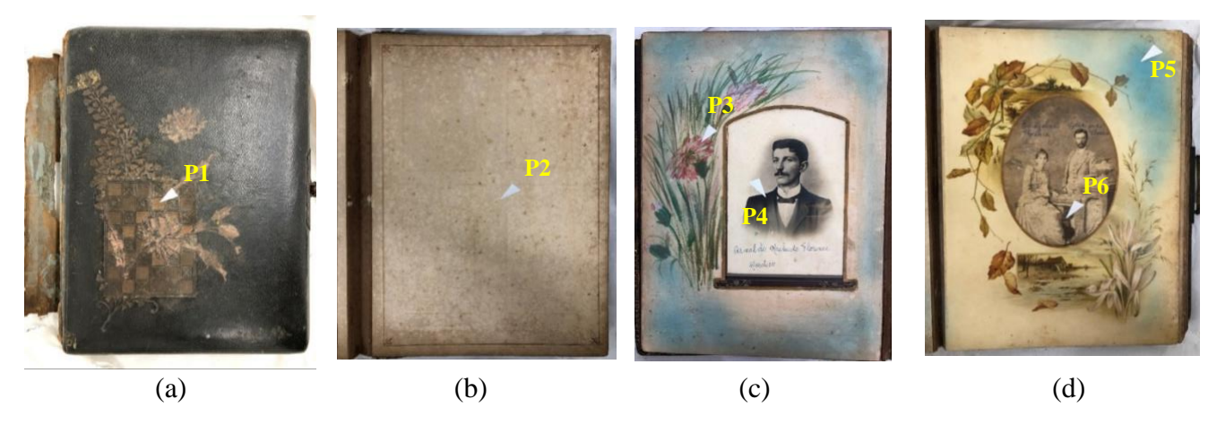
Figure 1: Locations of the measurement points in the photo album (a) P1 – album front cover; (b) P2 – endpaper; (c) P3 - rose flower engraving, P4 – photograph detail; (d) P5 – blue color, P6 – photograph detail

The PCE-CSM8 colorimeter was used at six selected points in the photo album (Fig. 1) before and after irradiation. The measurements were performed at least 48 hours after album irradiation, when the electron excitation process was already stable.