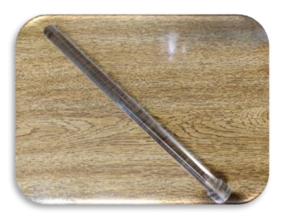
Figure 2: Rod-type phantom used to irradiations in H_p(0.07) .

The phantom rod type indicated in the recommendations of International Commission on Radiation Units and Measurements (ICRU) Report 47 [3] was used to calibration irradiations in H_p(0.07) . It is a water-filled hollow cylinder with PMMA walls, with outer diameter of 73 mm and length of 300 mm. The cylinder walls are 2.5 mm thick and the faces 10 mm thick [4], shown in Figure 2.