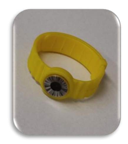
Figure 1: PTFE-Teflon ® holder and thermoluminescent detector of LiF:Mg, Ti.

The phantom rod type indicated in the recommendations of International Commission on Radiation Units and Measurements (ICRU) Report 47 [3] was used to calibration irradiations in H_p(0.07) . It is a water-filled hollow cylinder with PMMA walls, with outer diameter of 73 mm and length of 300 mm. The cylinder walls are 2.5 mm thick and the faces 10 mm thick [4], shown in Figure 2.